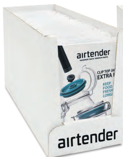
12x vacuum lid 90 mm incl. nanostopper