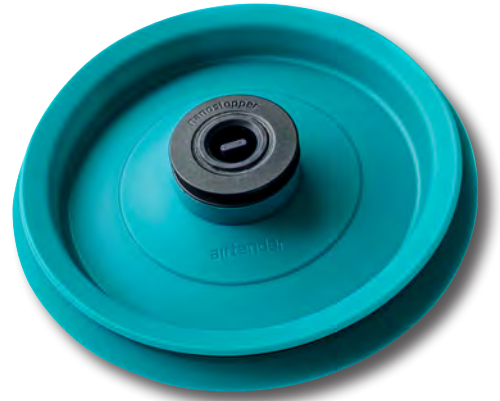
airtender vacuum lid incl. airtender nanostopper