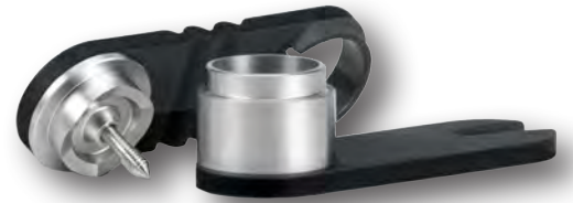
airtender lid punch