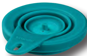
airtender vacuum lid Ø 60 mm