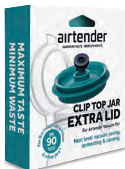
1x vacuum lid 90 mm incl. nanostopper