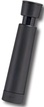
airtender vacuum pump