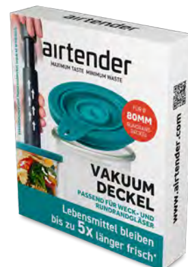
1x vacuum lid Ø 80 mm