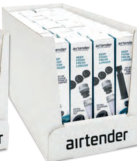
20x Set of 3 nanostoppers 20x vacuum pump incl. nanostopper

Do you have any questions? Would you like to order directly?