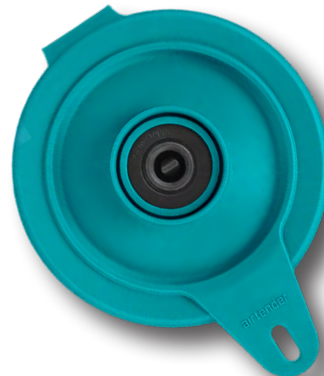
airtender swing top lid Ø 86 mm