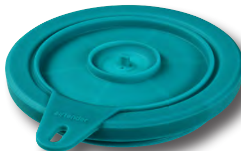
airtender vacuum lid Ø 100 mm