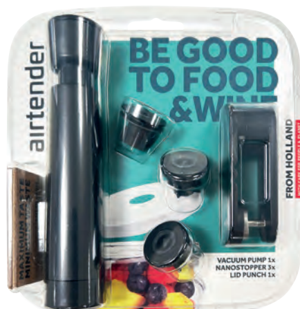
1x vacuum pump 3x nanostopper 1x lid punch