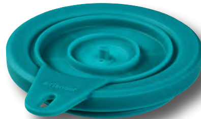
airtender vacuum lid Ø 80 mm