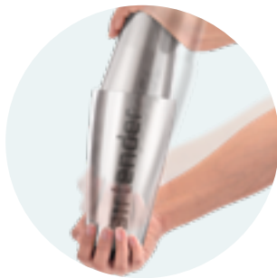
SHAKE FOR 10 SECONDS

Briefly shake the ingredients with ice in the classic tin-on-tin shaker, then aerate the mixture to create a generous amount of intensely flavoured foam. Strain into a glass and your cocktail is ready in seconds.