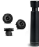
WINE VACUUM BLISTER PACK AT9431