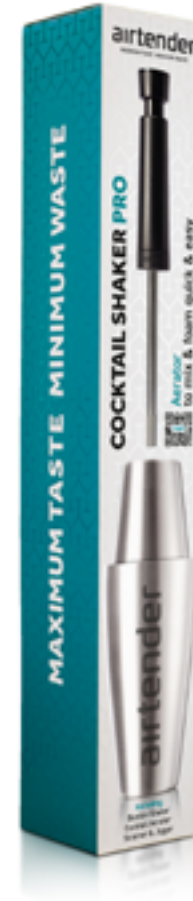
COCKTAIL SHAKER PRO AT9460