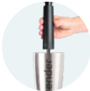
PUMP AIR FOR EXTRA FOAM

Drastically cut down on the shaking time. 10 seconds is enough. And there is no need to "dry" shake!