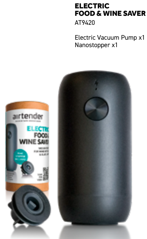
ELECTRIC FOOD & WINE SAVER AT9420