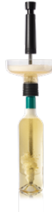
WINE AERATOR PRO AT9450

Air Pump x1 Aerator XL x1 Vortex Aerator x1