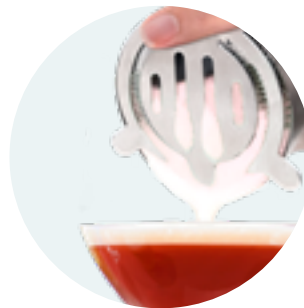
SERVE PREMIUM COCKTAILS IN SECONDS

Pump air into the mixture to finalize mixing, boost flavour and create an incredible amount of foam