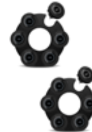
EXTRA STOPPERS GIFT BOX AT9435