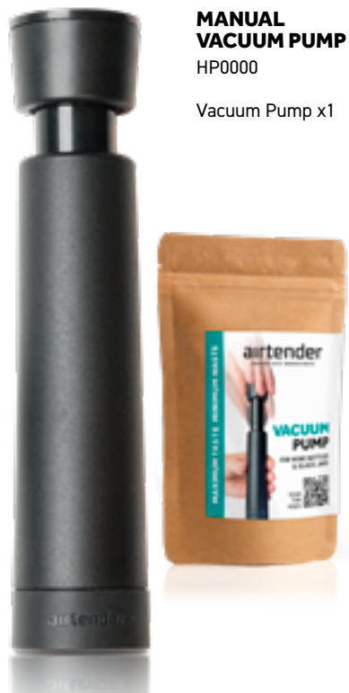
MANUAL VACUUM PUMP HP0000

For each type of lid, the compatibility with vacuum pumps and sets is listed on the corresponding page.