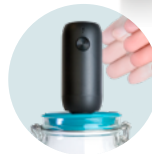
ONE-TOUCH AUTO STOP

Vacuum seal jars with Airtender lids as well as wine bottles by using the Nanostopper