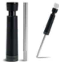
WINE AERATOR GIFT BOX AT9442