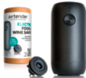
ELECTRIC FOOD & WINE SAVER AT9420