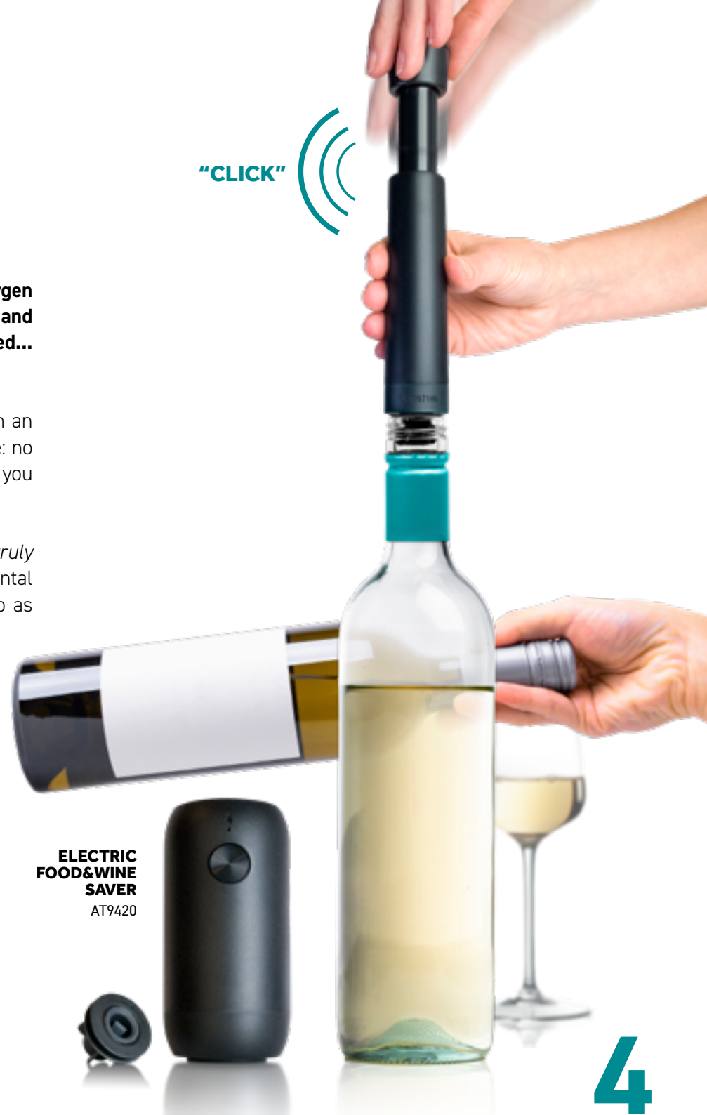
ELECTRIC FOOD&WINE SAVER AT9420