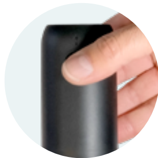
ONE TOUCH OPERATION

Start and stop the air and vacuum pumps by pressing a single button