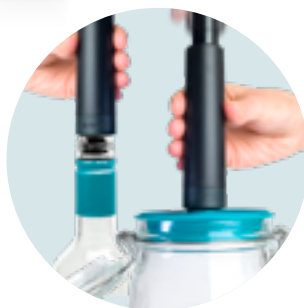
FOR JARS & BOTTLES

Start pumping to create vacuum and you will hear a "click" sound when you can stop