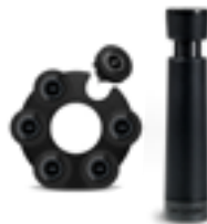
WINE VACUUM GIFT BOX AT9433

Vacuum Pump x1 Vacuum Stopper x6 Storage Clip x1