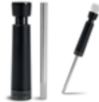
COCKTAIL AERATOR AT9445